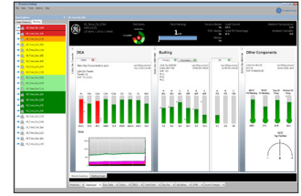
Transformer health/risk overview