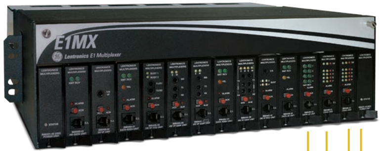
Power supply unit